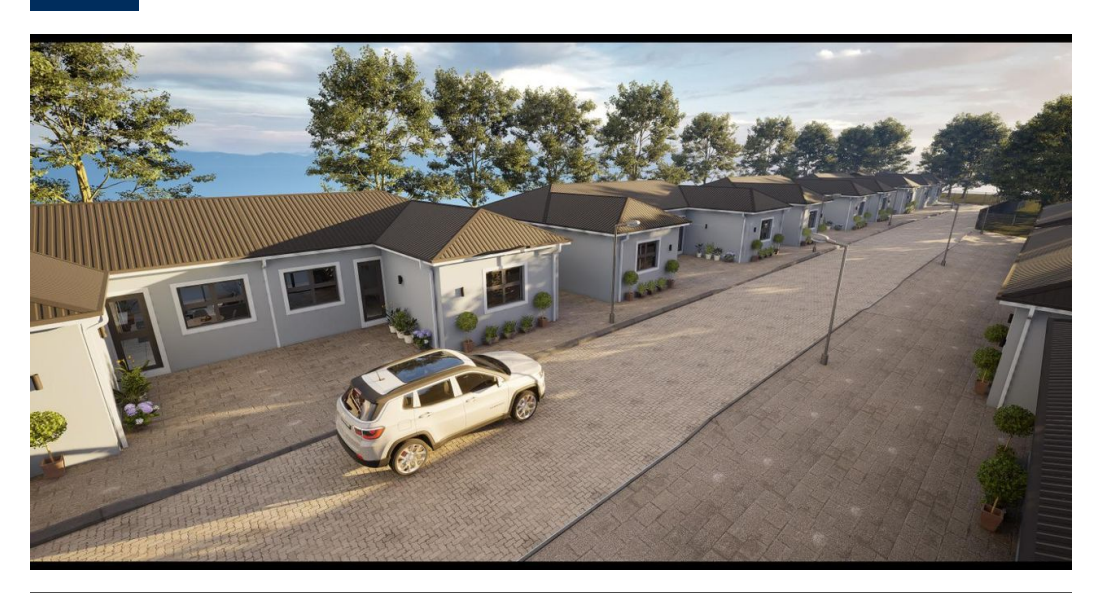
Web Ref ND169